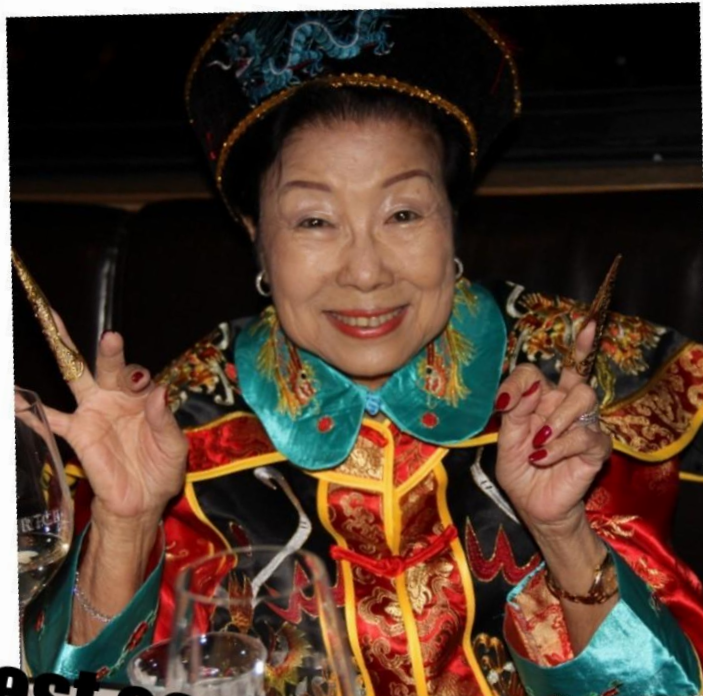
Best costume award