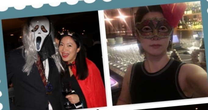
Who's the Ghost?

Not much to write about this special fellowship night. Pictures collection will talk by themselves. Useless adding that food was impressive and wine superb. Everyone definitely enjoyed the night and had a lot of fun. Pure dynamite!